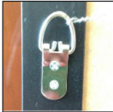
Acceptable hanging hardware: